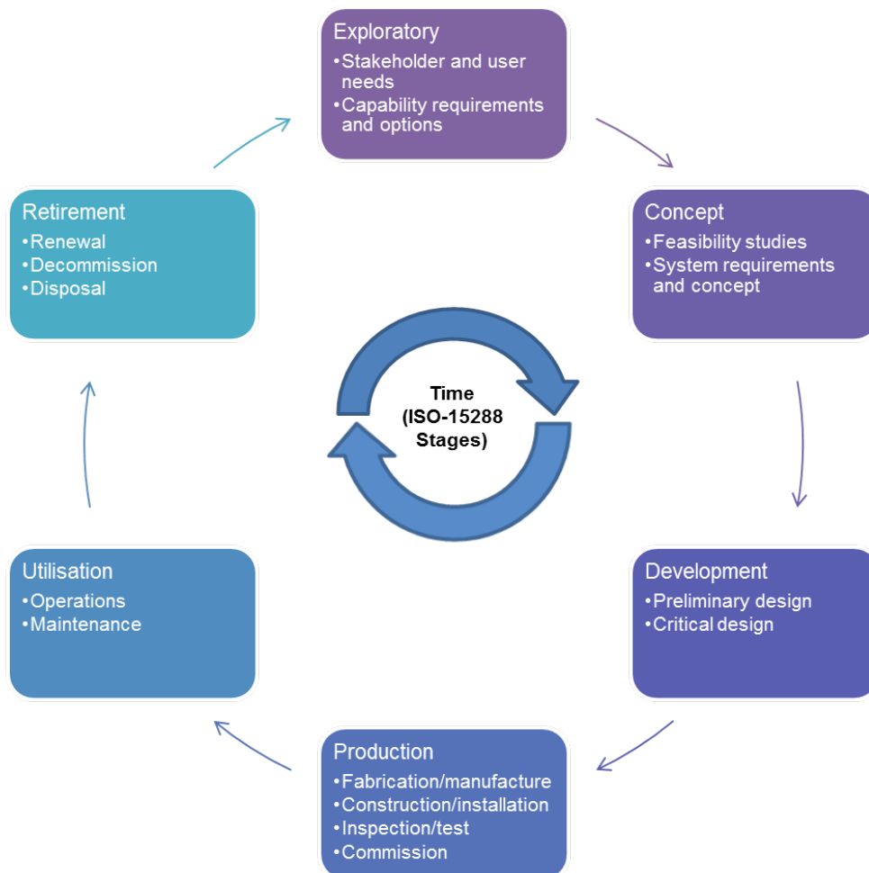
Figure 2: Asset life-cycle phases of ISO/IEC 15288-2008

Various asset or systems life-cycle models have been published which may provide guidance for this purpose, such as the diagram below, which is in accordance with ISO/IEC 15288.