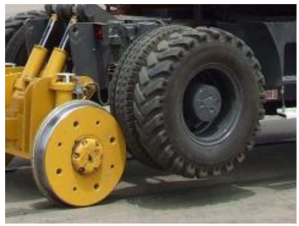
Figure 2: High ride Hi-Rail vehicle with friction drive directly on rail wheels

2. 9B – High ride – braking and traction forces are transmitted indirectly from the road wheels to either directly onto the rail wheels or through a drum that's fixed onto the rail wheels. The braking forces in this case come from the friction between the rubber tyre and rail wheel interface. See figures 2 and 3 for examples.