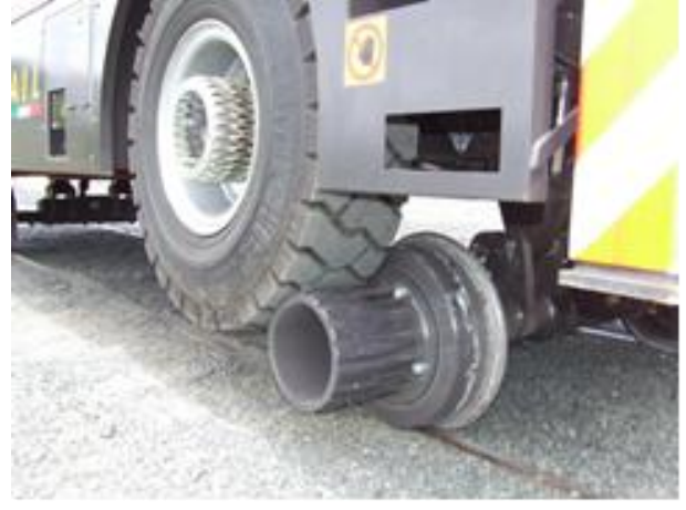
Figure 3: High ride Hi-Rail vehicle with friction drive directly on friction hub or drums fixed to rail wheels